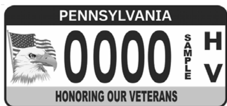
Honoring Our Veterans License Plates

Contact – Department of Military and Veterans Affairs, Office for Veterans Affairs, Bldg. 0-47, Fort Indiantown Gap, Annville, PA 17003; 1-800-547-2838, Fax: 717-861-8589; email: RA-VA-info@pa.gov