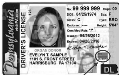
Veterans Designation on PA Driver's License/ID Cards www.dmv.pa.gov